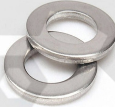
DIN 125 Washers

Send your Orders / Enquiries along with the following Item Codes